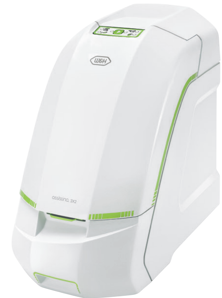
Assistina 3x2 3 instruments x 2 preparation steps: Internal cleaning, lubrication