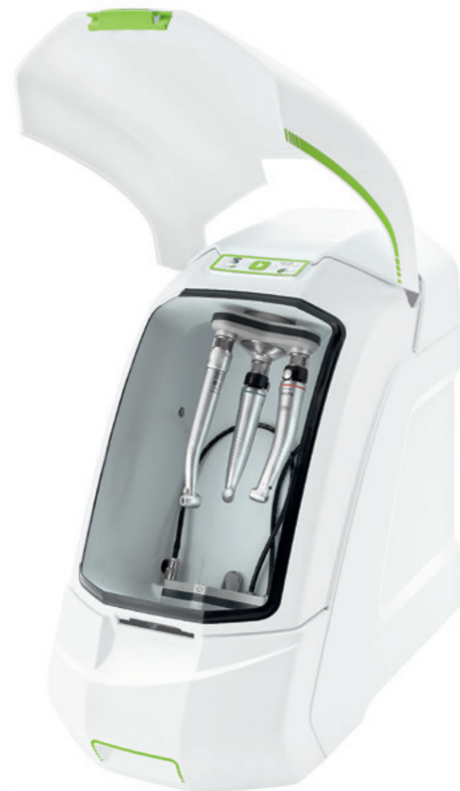
Assistina 3x3 3 instruments x 3 preparation steps: Internal cleaning, external cleaning, lubrication